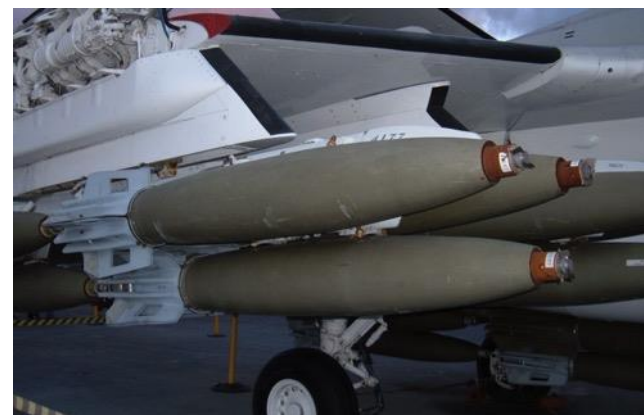
AIR BOMBS & MISSILES