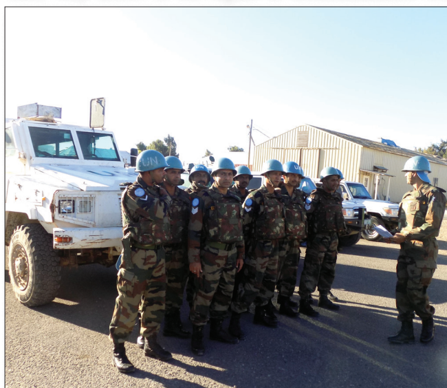
Maintenance platoon during a brief regarding logistic support

access points into UNDOF's Wifi and included new parts for the Corporate Network, Cobra Pipes and cables etc. The Signals Platoon are a vital asset in supporting UNDOF's move to the Bravo side and have been very active in the repair of communication sets