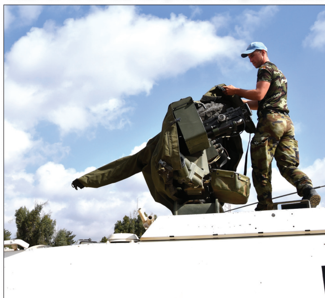
Important to keep dust and rain off the weapon when not in use

Apart from personal weapons, vehicle mounted weapons in a mounted or fixed state must always be covered when not in use and this protects the gun assemblies