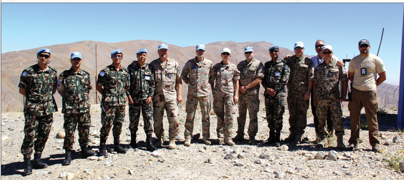
OGG members deploying to the Bravo side

group a few weeks later. With a teamwork approach and the support from the UN civilian staff, the Nepalese Contingent and the OGG Damascus staff, these UNTSO staff Officers will further develop UNTSO operational capability which will in turn greatly enhance and support UNDOF's mandate. Since deploying to the Bravo side the OGG staff officers have completed phase 1 of the plan that included completion of operational reconnaissance's to identify areas for the location of observation posts. Phase 2 will now com-