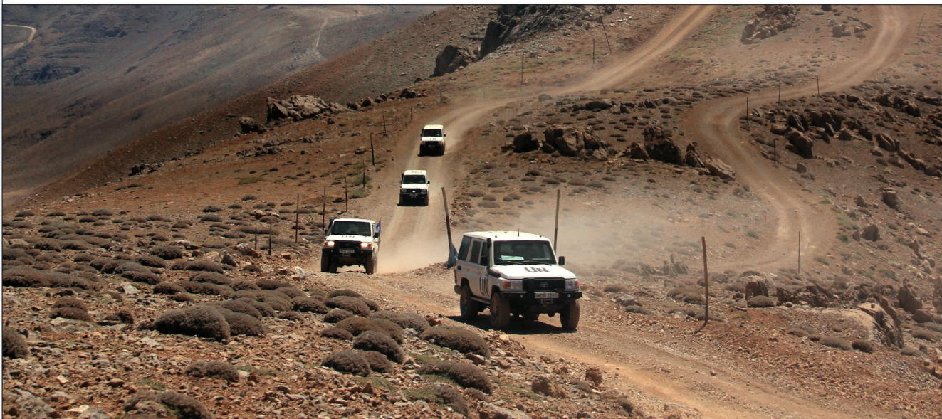
OGG's Operational Recce on the Bravo side