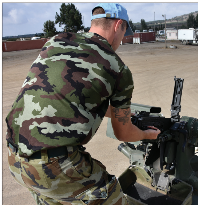
Cleaning the weapon and ensuring the mechanism is functioning prior to deployment

protective covers. The risks due to heat may affect the sensors whereby adhesives and rubber seals used in the internal assemblies can become damaged if exposed for prolonged periods of time. Grenade launchers mounted