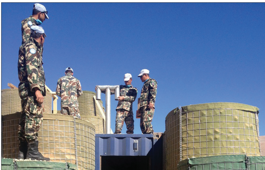
Newly completed bunker in an UNDOF position

The Engineer Platoon continue to make great progress in enhancing key infrastructure within UN positions and over the last few weeks and have completed the construction of several OP's inside UNDOF outposts. Along with the completion of perimeter improvement works this construction project has helped enhance security infrastructure for personnel deployed in positions on the Bravo side. The Engineers have been making great prog-