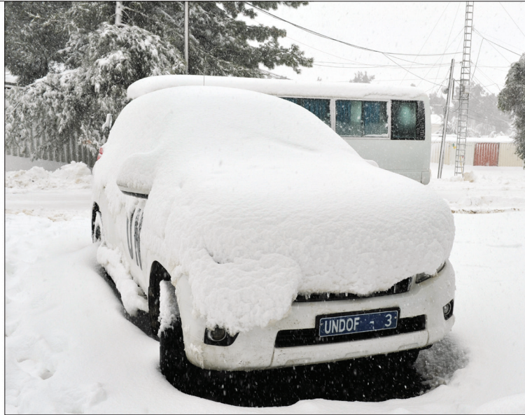
Challenges for drivers in UNDOF

Safety Assist - Be familiar with the vehicle type and know the safety assist technology e.g. ABS.