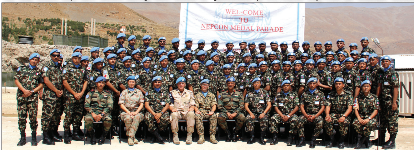
FC/HoM, distinguished guests and NEPCON after receiving the medal.