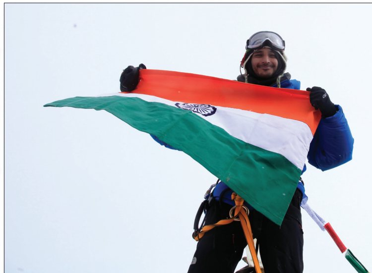
Article by Logbatt SMO Major (Dr) Ritesh Goel

This is a high level severe weather warning and implies that recipients should take action to protect themselves and/or their properties; this could mean that those in affected area may need to move out of the danger zone temporarily, or stay indoors or take specific actions aimed at mitigating the effects of the weather conditions.