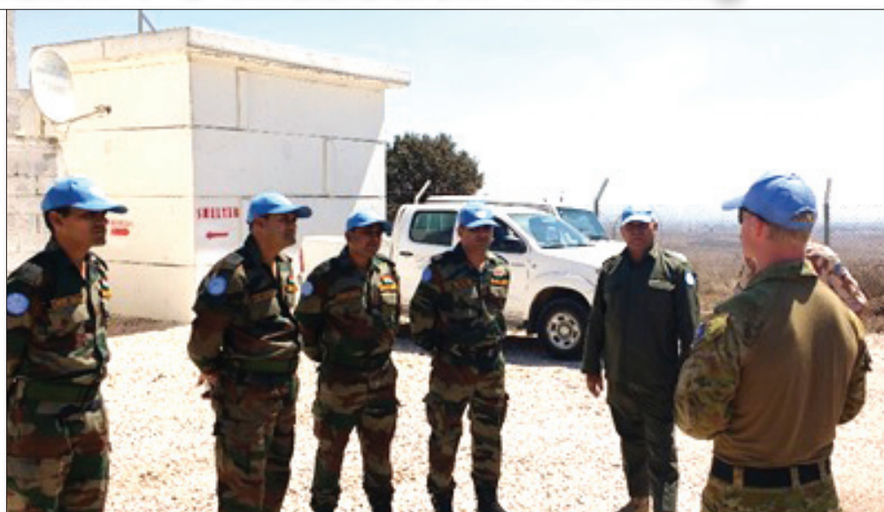
Logbatt Officers receiving a brief during their induction training

The officers visited various Positions and were briefed on the operational challenges pertaining to UNDOF, the Mission and functioning of the forces many elements