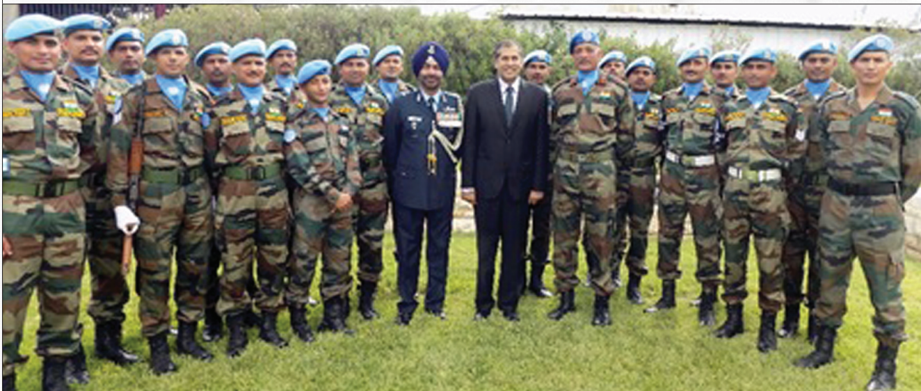
FC/HoM, His Excellency the Indian Ambassador and INDCON Officers at the Haifa Day Commemoration