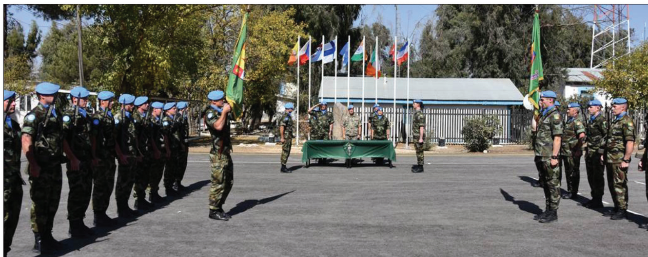
FRC handover/takeover parade at the Camp Ziouani

array of experience both at home and abroad with a total of three hundred and one individual tours of duty overseas to missions including ISAF, UNIFIL, MINUSCO, MINURCAT, UNTSO, UNMEE and UNFCYP. Go n-éirí an t-ádh leis an 54ú nGrúpa Coisithe, (the very best of luck to the 54 Inf Gp).