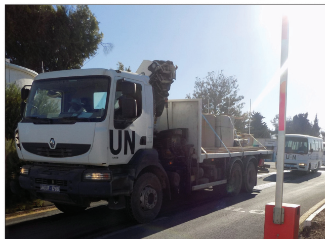
Convoy leaving for UNP 80

The maintenance section has a very important role in ensuring the UNDOF's vehicles are ready to provide