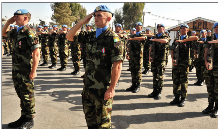
General salute accorded to FC/HoM