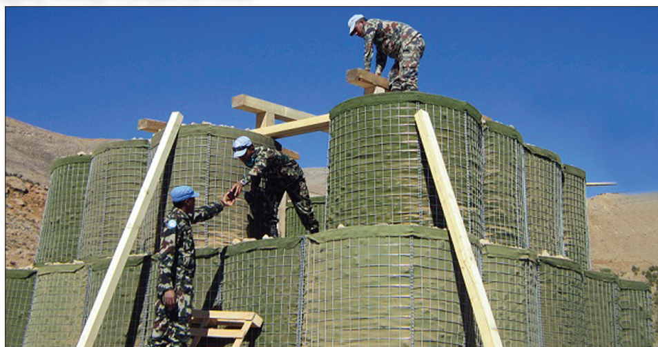
UN OP under construction

for the local Commander which supports operational effectiveness during all types of scenario's. The Engineer Platoon have also been very busy enhancing drainage around the external perimeter which includes the installation of outlet pipes and the digging of drainage trenches which helps in ensuring that UNDOF positions are ready for the Golan winter.