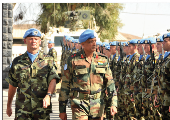
FC/HoM inspecting the troops on Parade