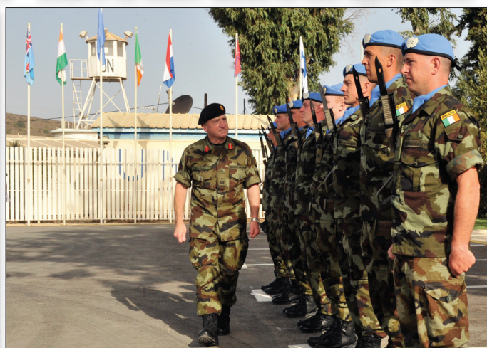
Irish DCOS Ops inspects the Honour Guard at Camp Ziouani