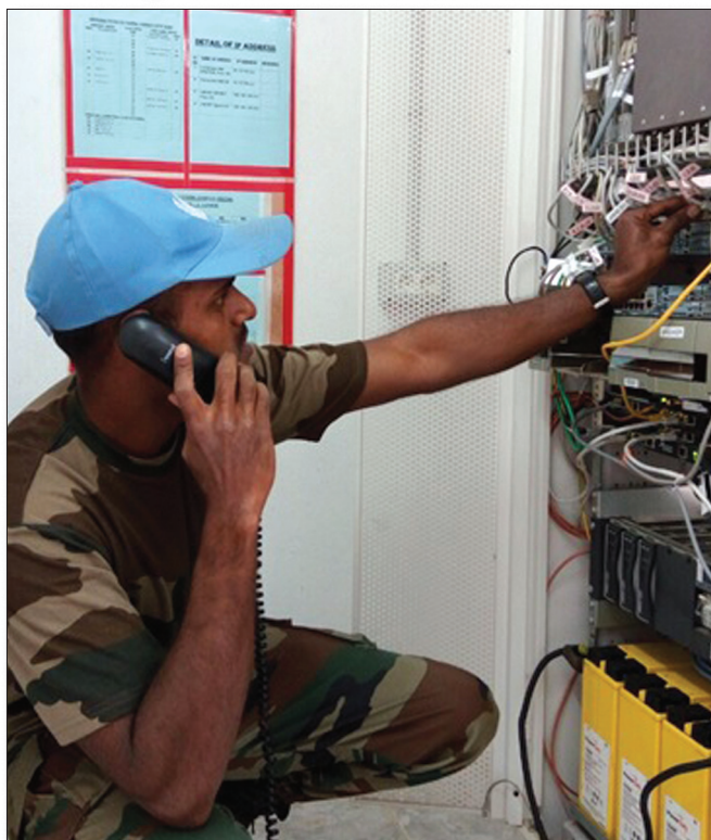
Upgrading communications at UNP 80

The Signals Platoon have been focused on upgrading the communications infrastructure in UNP 80. This programme involved the installation of new