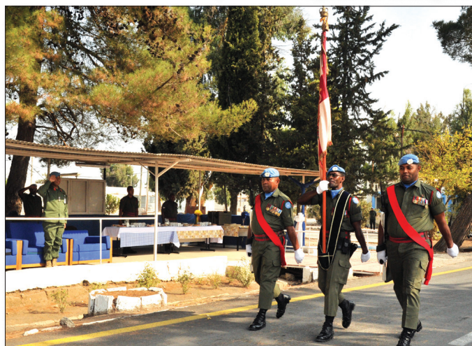
1st Fiji Infantry Regiment Colour marched onto the Parade Ground

the Fijian Battalion would contribute positively to the UNDOF mission and focus on the UNDOF vision of "One Mission, One Team, One Goal" while gearing up for its transition process from the occupied Golan territory to the mandated area of separation.