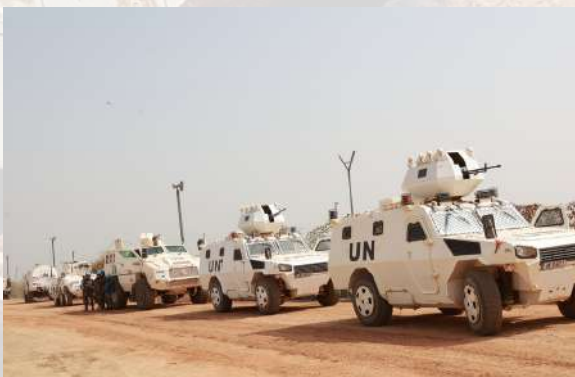
GHANBATT PATROL IN SECTOR SOUTH