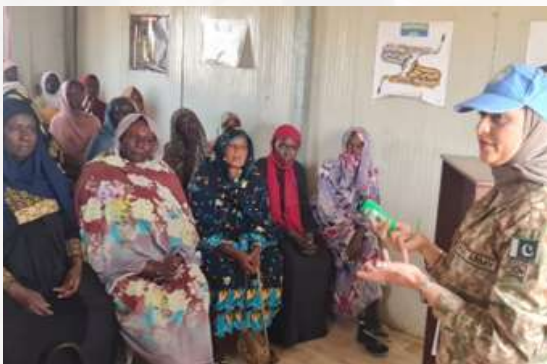
MEDICAL AWARENESS SESSION BEING UNDERTAKEN BY PAKBATT- II