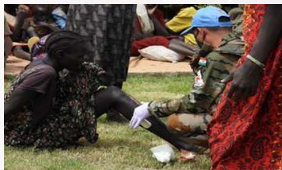
AN INDIAN PEACEKEEPER TENDING TO A WOUNDED IDP AT DOKURA