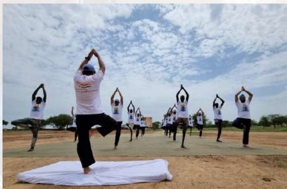
YOGA DRIVE BEING UNDERTAKEN BY INDBATT IN CENTRAL SECTOR