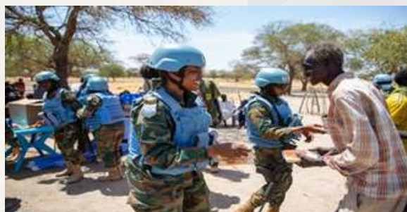
GHANBATT COMMUNITY ENGAGEMENT TEAM IN ACTION