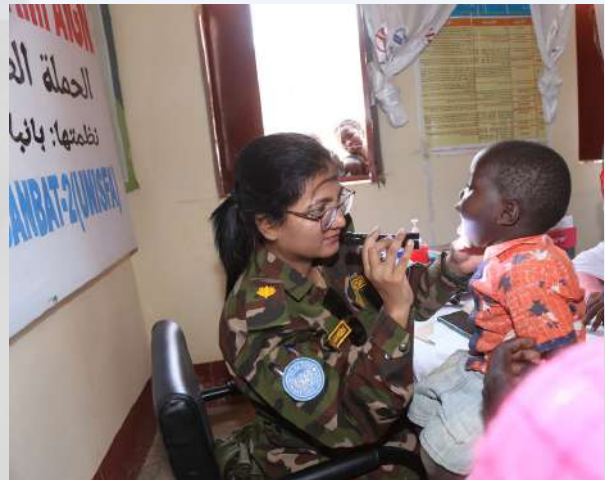
MEDICAL CAMPS ORGANISED BY BANBATT