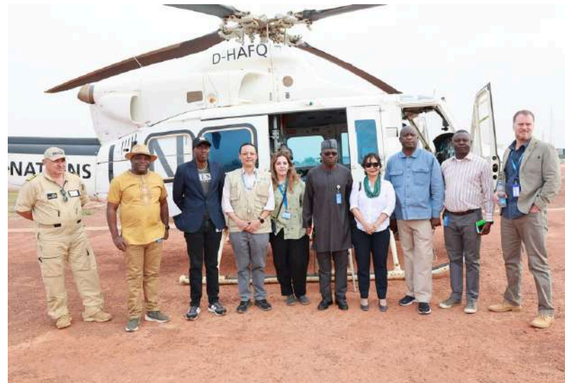
Ag HoM/ FC leading the UNISFA delegation on a four day official visit to Juba