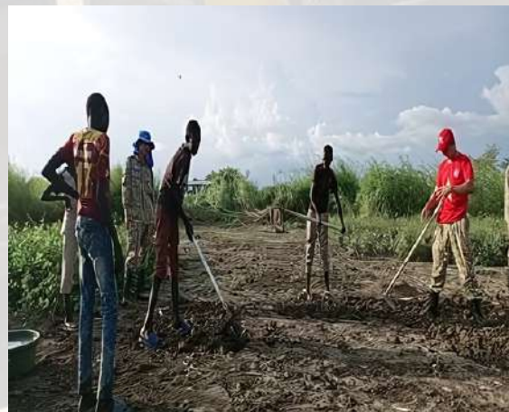
EDUCATING THE LOCALS ABOUT MODERN FARMING TECHNIQUES

UNISFA is dedicated towards fostering a brighter future by promoting education within the local community. We firmly believe in nurturing the talents of the next generation through education, thus empowering them to make positive contributions to the creation of an inclusive society.