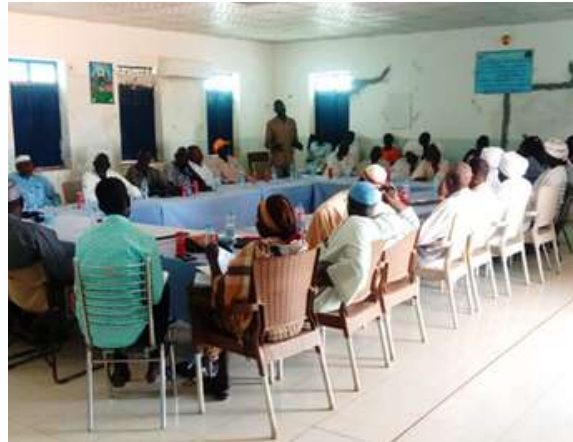
PAKBATT-II ORGANISING INTERCOMMUNITY MEETINGS TO FOSTER PEACE AND CONFIDENCE AMONG TRIBES