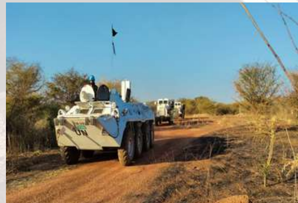
GROUND MONITORING MISSIONS BEING UNDERTAKEN BY BANBATT-II AT TISHWIN