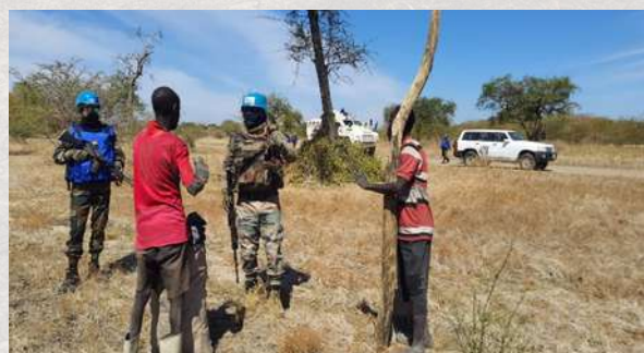
PEACEKEEPERS FROM INDBATT CONDUCTING AREA DOMINATION PATROL IN CENTRAL SECTOR