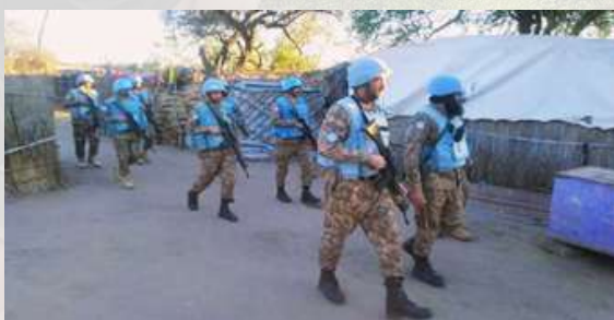
PEACEKEEPERS FROM PAKBATT- II CONDUCTING AREA DOMINATION PATROL IN SECTOR NORTH